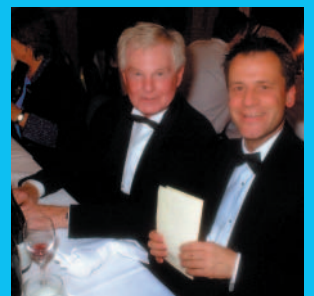
Derek Jacobi with Michael Grandage at the 2003 Crucible Gala